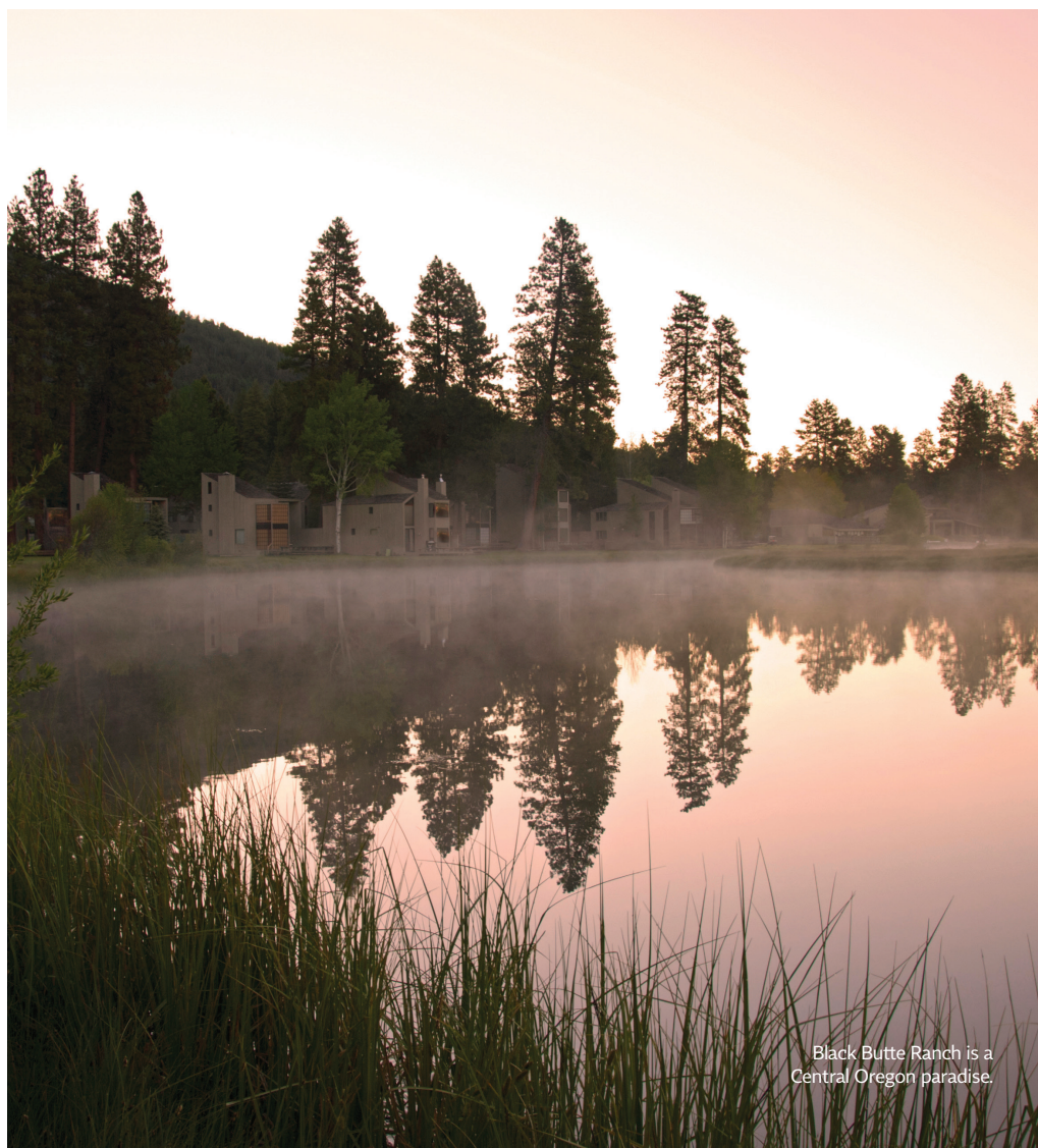
Black Butte Ranch is a Central Oregon paradise.