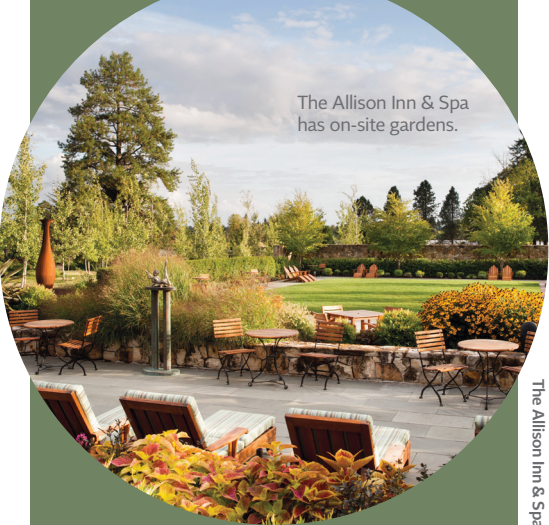
The Allison Inn & Spa

Silvies Valley Ranch has been operating as a cattle ranch (and a bunch of other weird schemes over the years) since the 1880s. But last year, the ranch added a thirty-four room eco-resort called The Retreat, Links & Spa at Silvies Valley Ranch. King beds, private log cabins, and a recently added full-service spa all combine to make this spot luxury with a Western twist. You can hit the golf course, go on an authentic cattle drive, try your hand at the shooting range, or get out and explore the thousands of acres around you. If you go golfing, please indulge in one of the resort’s goat caddies, which are exactly what they sound like.