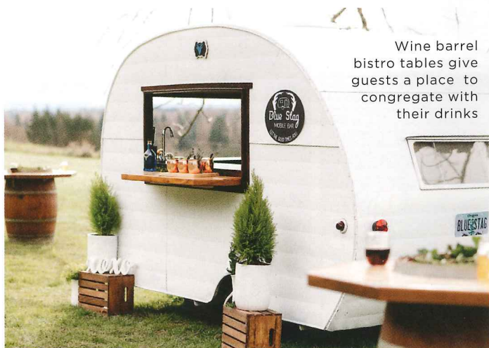
Wine barrel bistro tables give guests a place to congregate with their drinks

H eadlands Coastal Lodge and Spa is a new, 33-room luxury lodge (with 18 adjacent two- and three-bedroom cottages) located in Pacific City, about a two-hour drive from Portland. Intimate weddings and elopements can be held outdoors, near the waves crashing off Cape Kiwanda, or inside in the private event spaces. As many as 30 guests can be accommodated in the two conference rooms, called Longitude and Latitude, which are adjoined by an open-air courtyard and feature state-of-the-art audiovisual equipment. There are additional cozy spaces throughout the lodge, including the Fireside Room, which can hold as many as 30 guests for a reception. It also has accordion-style windows that open to draw in the ocean air. In-house food and beverage services feature innovative Northwest coastal cuisine paired with wines from Oregon, Washington and beyond, as well as brews from Pelican Brewing. headlandslodge.com — Susannah Bradley