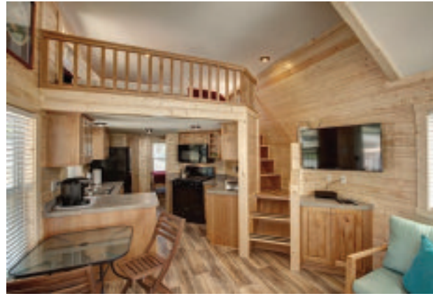
Clockwise from left: Hop on one of Tillamook Coast's hiking trails; Sheltered Nook in Bay City is a complex of for-rent tiny homes; located on the grounds of a World War II naval air base, Tillamook Air Museum can be rented for events; the 235-foot Haystack Rock is a landmark on Oregon's coast; all of the rooms at Headlands Coastal Lodge and Spa feature bike and surfboard racks.