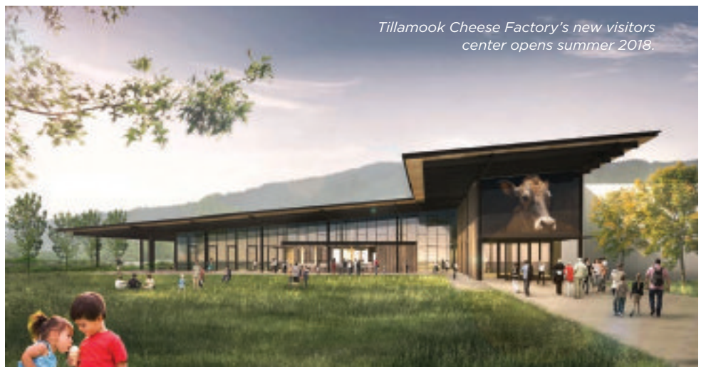
Tillamook Cheese Factory's new visitors center opens summer 2018.