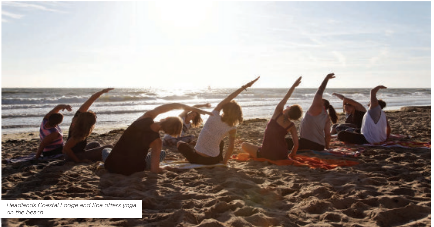
Headlands Coastal Lodge and Spa offers yoga on the beach.